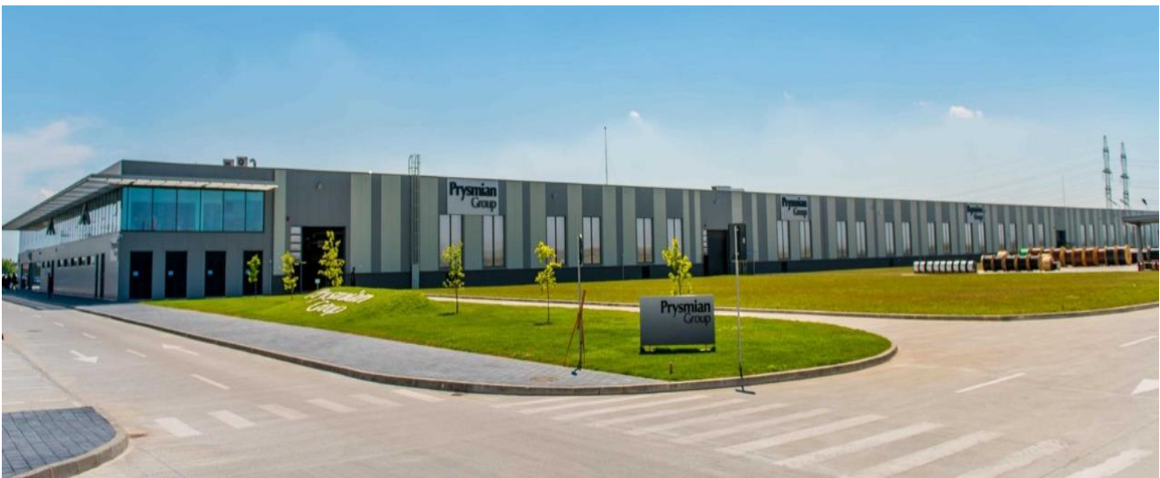
Figure 1. Slatina plant

The Slatina factory covers an area of almost 100.000 square meters, with a covered area of about 42.000 square meters, for a total annual production capacity of 30.000 tons of energy cables (from High Voltage cables up to 110kV and building wires, to Power and Instrumentation & Control cables), almost 1.500.000 km of optical cables and 500.000 km of copper telecom cables, covering almost all possible demand for both optical fibre and copper telecom cables types.