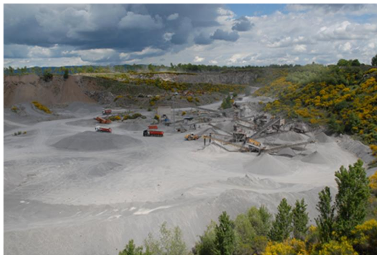
Fig.1 Basalti Orvieto quarry

Name and location of production site: Castel Viscardo quarry (TR)