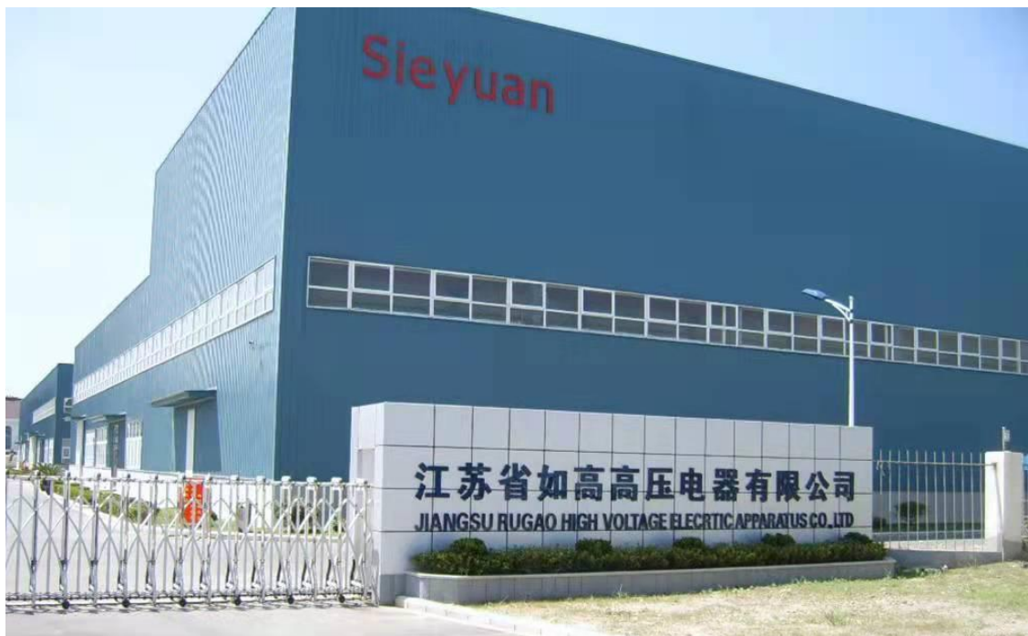
Figure 1.1 – Jiangsu Rugao High Voltage Electric Apparatus Co., Ltd.

Jiangsu Rugao High Voltage Electric Apparatus Co., Ltd. is a well-known enterprise specialized in R&D and production of power transmission and transformation equipment. The company was established in 1967 and has more than 50 years of R&D and production experience. Mainly produce high voltage AC disconnectors (800kV and below), circuit breakers (252kV and below) and HGIS (T) (145kV and below). Rugao company is the drafting unit of 16 national standards and industry standards such as GB/T11022. All products have completed a full set of type tests by third-party authoritative verification agencies at home and abroad (including Xi'an High Voltage Apparatus Research Institute, CESI, KEMA, etc). The product technology has reached the international advanced level, and it has won the provincial and ministerial quality product awards and the scientific and technological progress award for many times. 48 products have successfully passed the national or provincial new product appraisal. It has 120 national independent intellectual property patents, including more than 40 invention patents. The company fully implements an ERP management system and quality management throughout its life cycle, and implements a delivery project manager system to maximize customer needs.