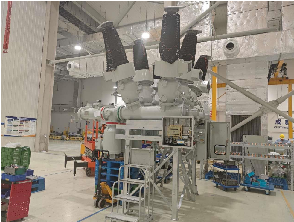
Figure 2.1 - Hybrid Gas-Insulated Switchgear ZHW58A-72.5

The product manufacturing process is as follows: